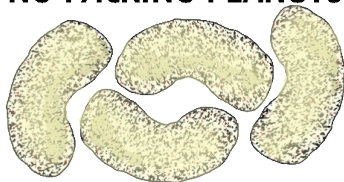
While packing peanuts are an affordable, lightweight packaging option in the economy, they have negative environmental effects.